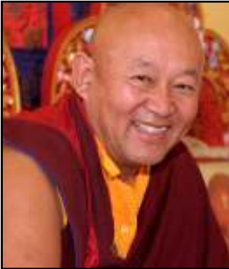
His Holiness the Drikung Kyabgon Chetsang Rinpoche

Drinking Namgyal Ling is happy to announce the opening of its new Dharma Center to serve the needs of Tucson and Southern Arizona.