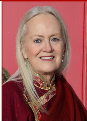
Lama Tsultrim Allione